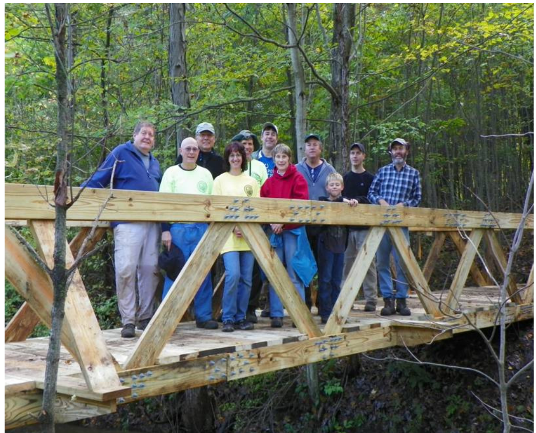
Some of the many folks who helped build another bridge for Victor Hiking Trails.