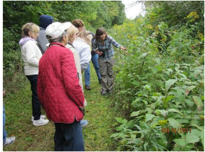
Looking for plants to attract birds.